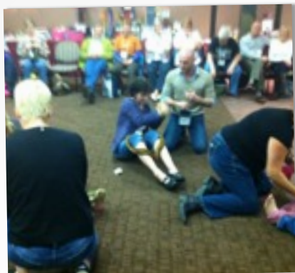
THURSDAY EVENING GAME

On Friday evening we will be presenting a Fashion Show where you will see (and be able to feel) fabulous garments and accessories. After the Fashion Show there is time for you to try on garments.