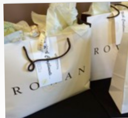
AMAZING DOOR PRIZES