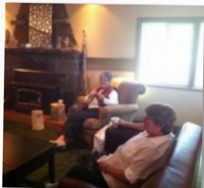
KNITTING BY THE FIRE